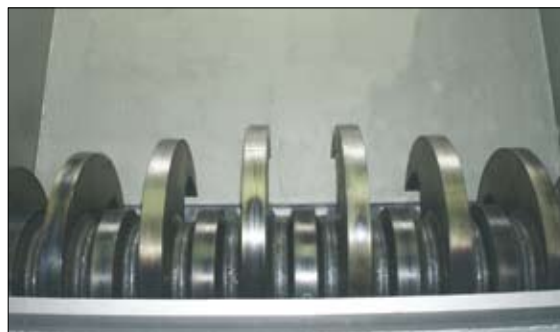
Single shaft frozen block crusher