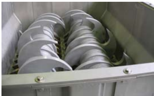
Double shaft frozen block crusher

All Haarslev solutions are tailormade and the frozen block crushers can be supplied to fit most applications with a wide range of hoppers, mounting frames, feed and discharge systems according to customer specifications.