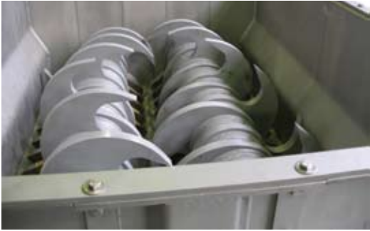
Double shaft frozen block crusher

All Haarslev solutions are tailormade and the frozen block crushers can be supplied to fit most applications with a wide range of hoppers, mounting frames, feed and discharge systems according to customer specifications.