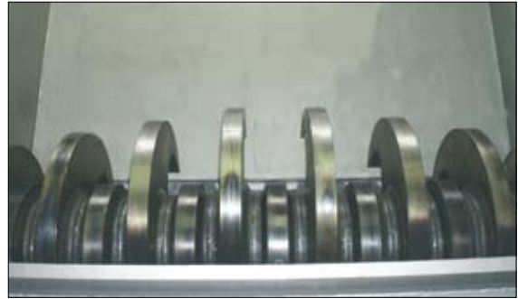
Single shaft frozen block crusher